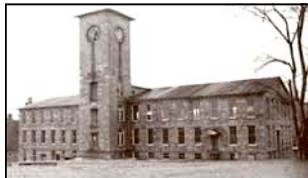
Nov. 23, 2013 - 10 am - Kirby Mill, Mansfield Hollow

Check our website for more information on the Mill of the Month http://www.millmuseum.org/